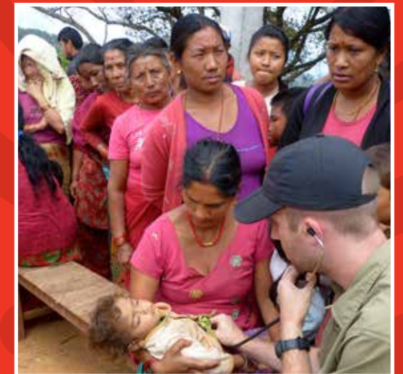
Examining patients in Gorkha

At our special treatment facility, Green Pastures Hospital and Rehabilitation Centre, we have provided ongoing rehabilitative care and support for 33 patients to date, as well as monitoring the wellbeing of our community based disability clients in areas affected by the earthquake.