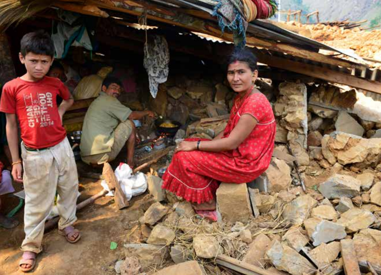
Cooking a meal in a temporary shelter

“It was as if the earth was exploding like a volcano. Rocks flew everywhere as the ground shook and trembled violently. Everything around me began to collapse leaving only a single wall of my house standing amidst the rubble.”