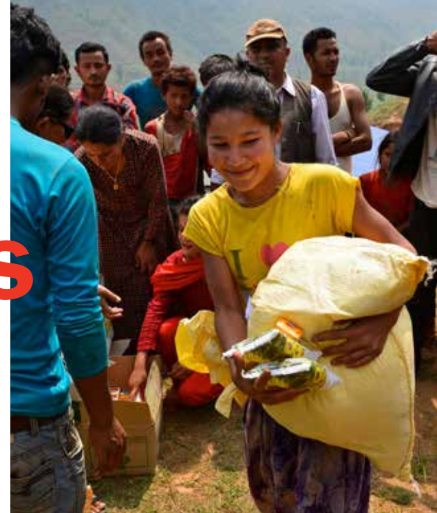
A young woman receives cooking oil and other relief supplies

Similarly the Pokhara Christian Community [PCC], a platform of 45 churches in the Pokhara valley, initiated a similar collaborative disaster response effort between