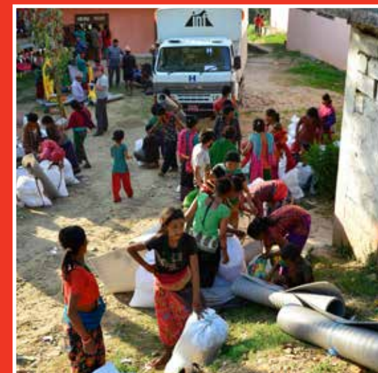
Sorting relief supplies before carrying them home

Since then, INF has signed a formal agreement with the Nepal Government to take responsibility for four Village Development Committee areas in Gorkha, where our first priority has been the construction of 115 temporary schools, called Transitional Learning Centres, in 30 different locations.