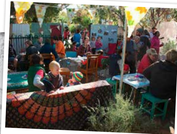
Nepal Fundraiser in Alice Springs, Australia