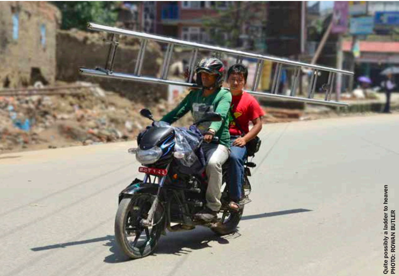
Quite possibly a ladder to heaven