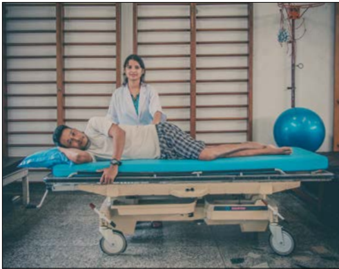
gift code A2

This gift provides awareness material for volunteers to give to Nepali migrants who, forced to travel to India to look for work, are particularly vulnerable to abuse and exploitation. Churches are given a chance to connect with those travelling to look for work, and explain to them the dangers and risks they might face and how to avoid them.