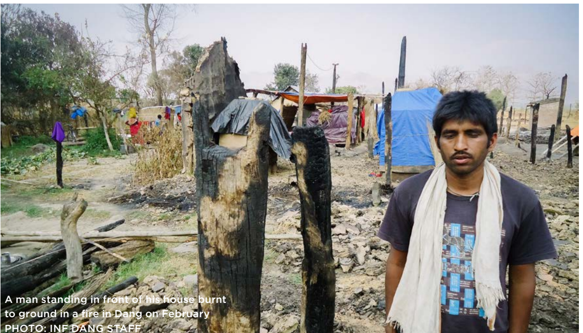
A man standing in front of his house burnt to ground in a fire in Dang on February

PRAY | DONATE | JOIN US | SHARE – Please PRAY for those affected by natural disasters in Nepal and consider GIVING to the newly formed Disaster Response and Resilience Department that helps those most in need in these times of crisis.