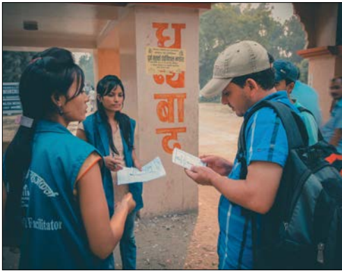
gift code C1