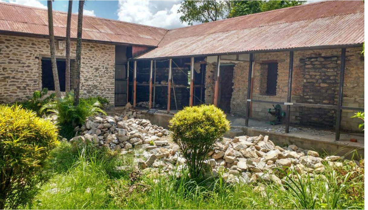
Construction begins on the old operating theatre