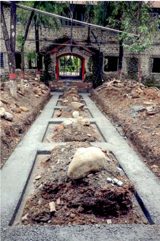
Foundation work near the main entrance