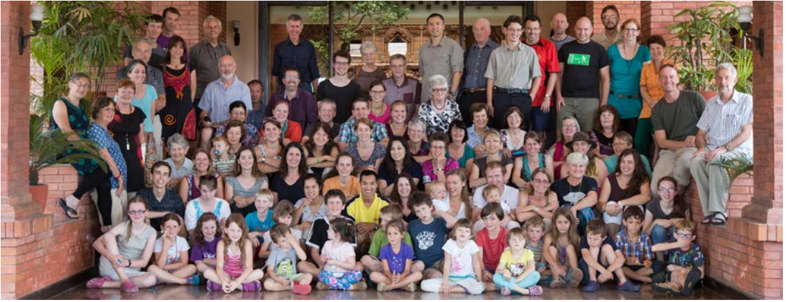
INF Expat Conference 2015