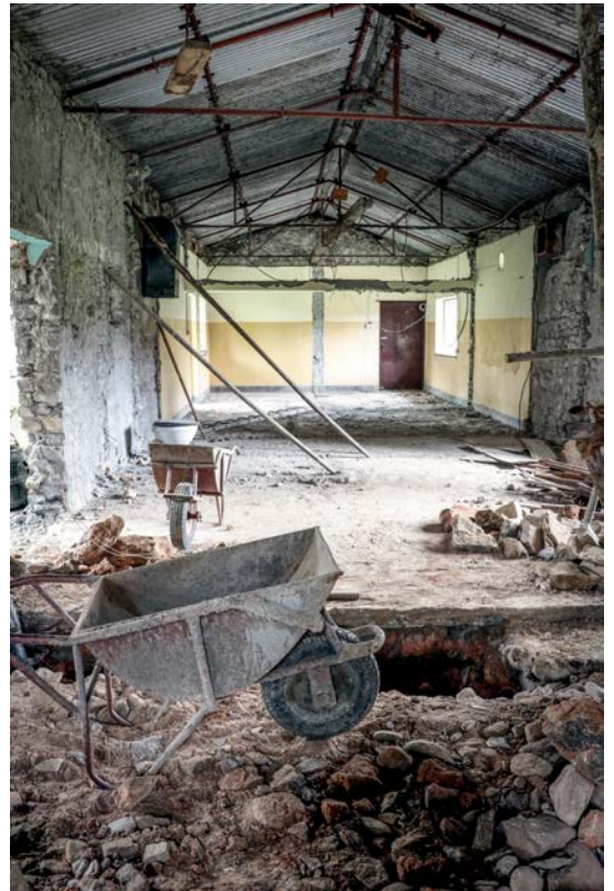
Renovating inside ground floor rooms