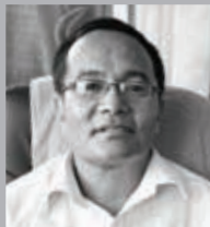
RAM BDR SINJALI