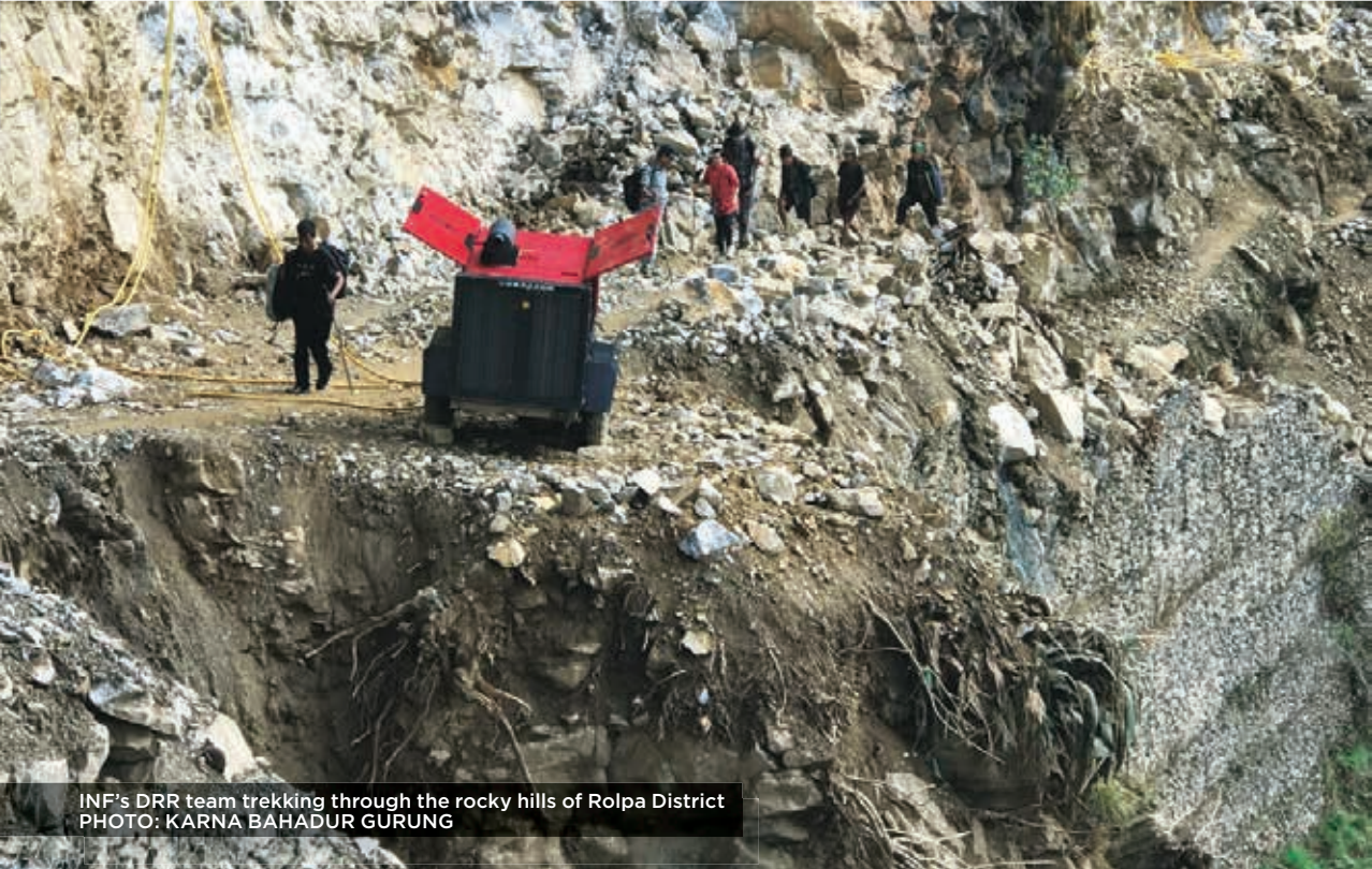
INF's DRR team trekking through the rocky hills of Rolpa District

A mountainous landscape and low socio-economic status leave the people of Nepal incredibly vulnerable to ever increasing threats from climate change and natural disasters. INF has now woven disaster response and resilience philosophies through much of its work to empower and equip communities into the future.