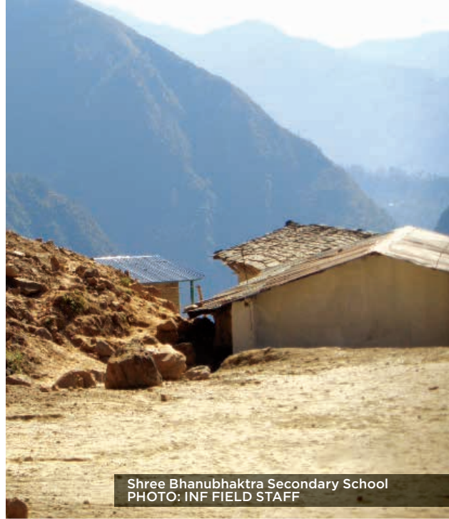
Shree Bhanubhaktra Secondary School

By integrating adaptive and risk reduction strategies into its community health and development work INF is helping Nepalis tackle the affects of climate change and natural disasters head on.