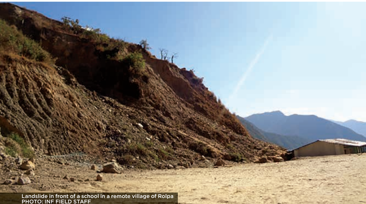
Landslide in front of a school in a remote village of Rolpa