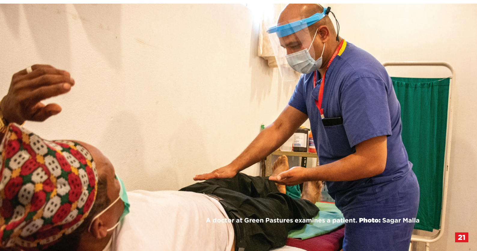
A doctor at Green Pastures examines a patient.

Interested to know more? Your regular gift is the most effective way to provide support to INF Australia. It creates reliable income that allows our partners to plan responsibly for their projects. Visit www.inf.org.au/communitiesofhope to learn more and sign up to be part of the family.