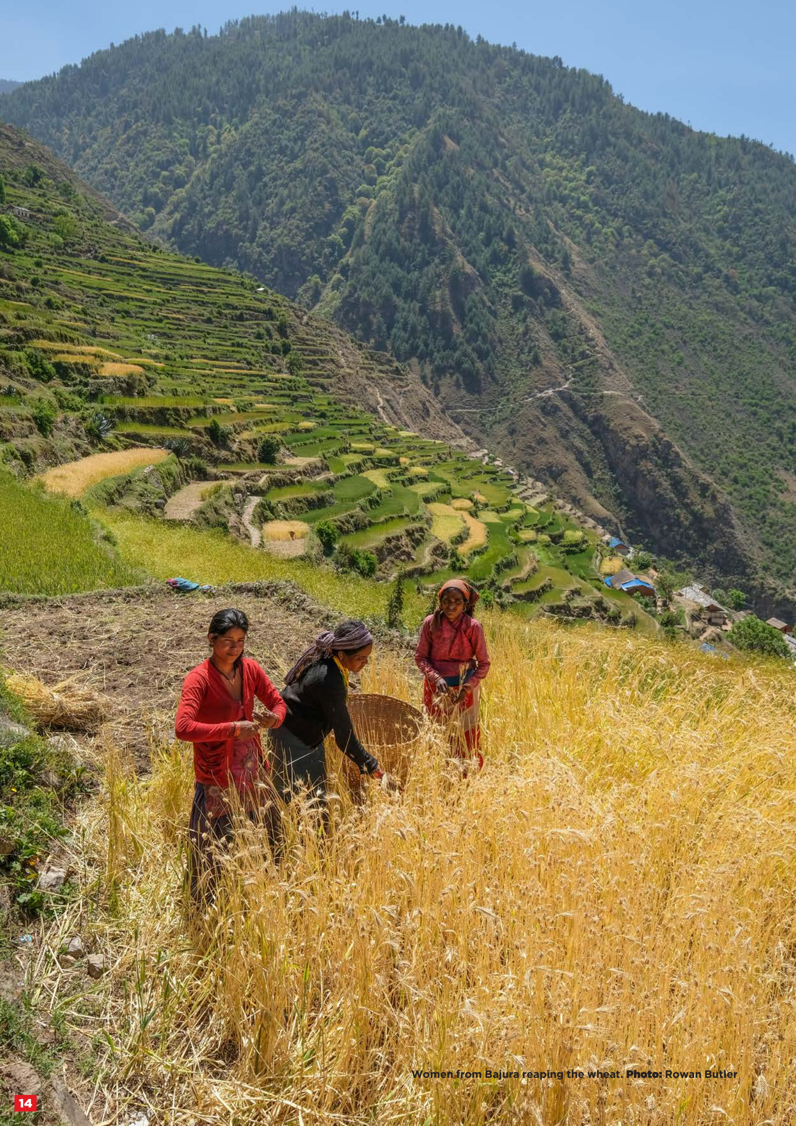
Women from Bajura reaping the wheat.