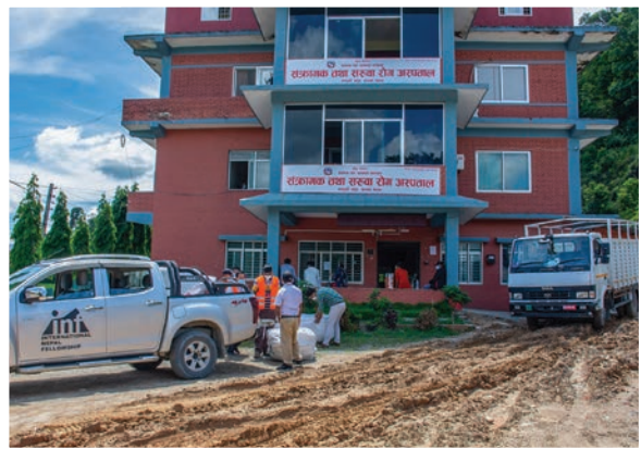
INF provided medical equipment, supplies and two nurses on secondment to the Infectious and Communicable Disease Hospital in Gandaki Province.