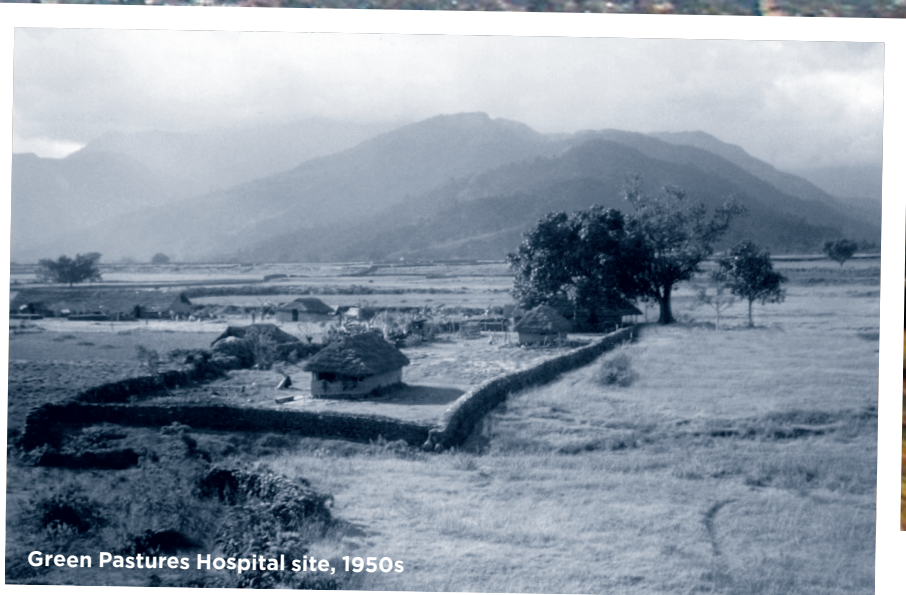
Green Pastures Hospital site, 1950s