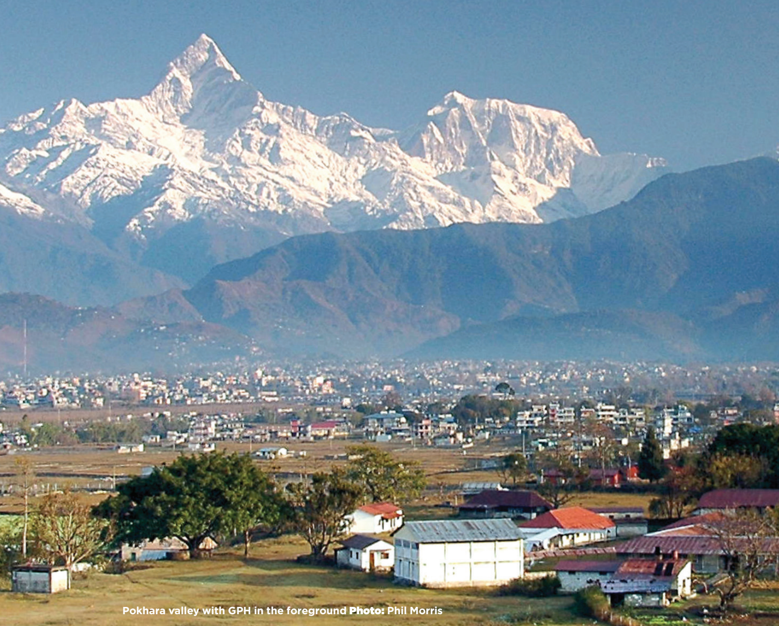
Pokhara valley with GPH in the foreground