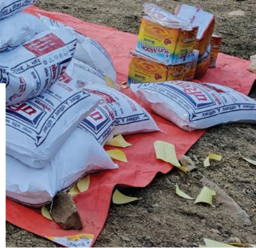
Food relief packages were distributed to families impacted by lockdown and COVID-19 in Goruchaur and Jumla (top) and Rolpa (left).