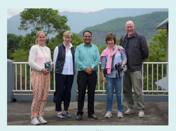
Representatives from Pro filia