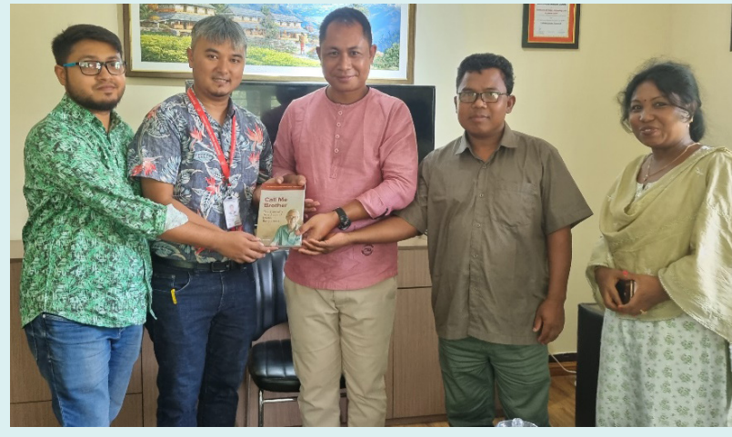
Representatives from Kailakuri Bangladesh